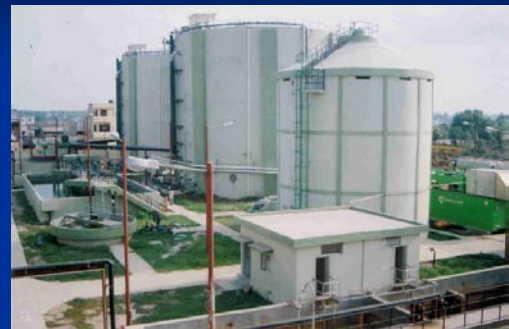
DIGESTER AND GAS HOLDER